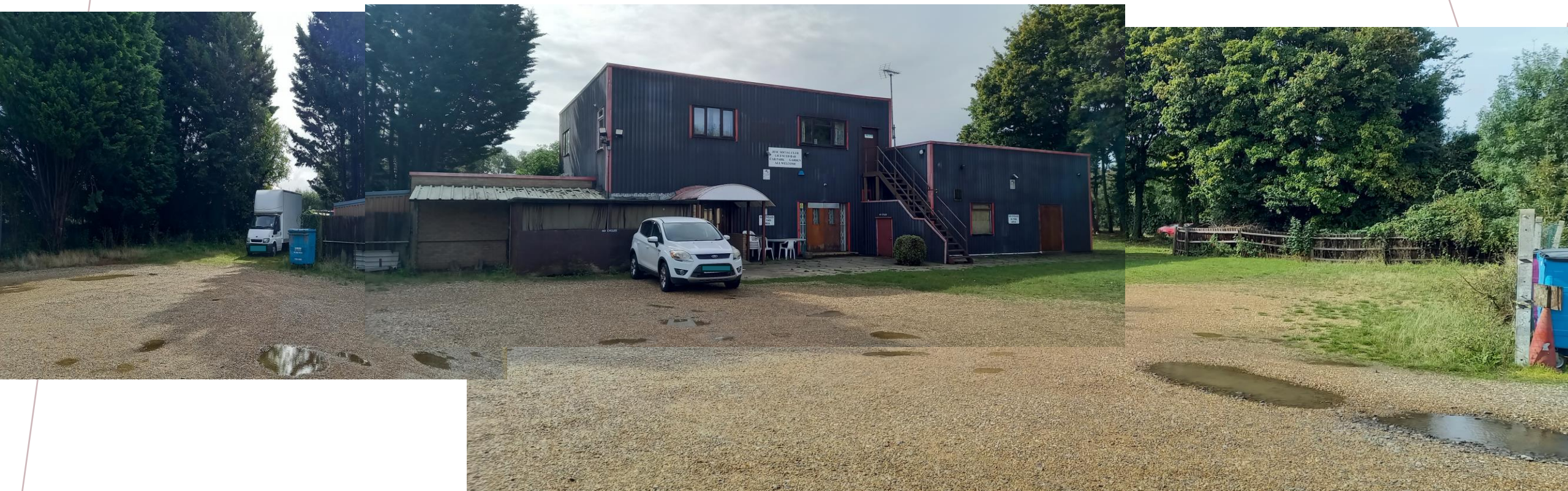
Site before works commenced