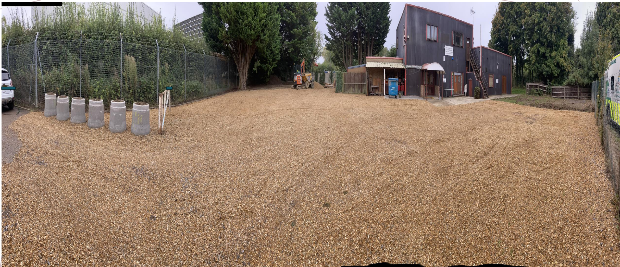
Site after Works