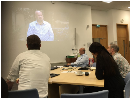
July meeting: Watching 'A hand up not a hand out' video

The Changing Futures Strategic Board has met twice now, in July and October, sharing ideas across a number of organisations and people with lived experience. The July meeting looked at principles for the programme, and the October meeting continued those thoughts while learning from the national Changing Futures programme. Find out more 🔗here .