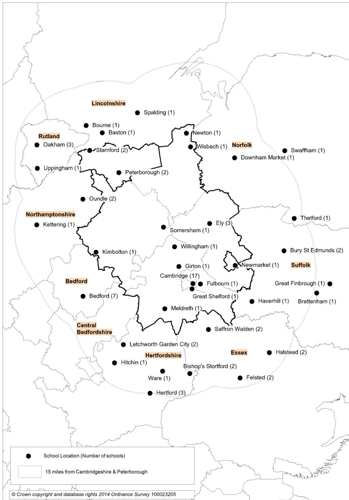
Figure 1: Independent Schools in and around Cambridgeshire and Peterborough