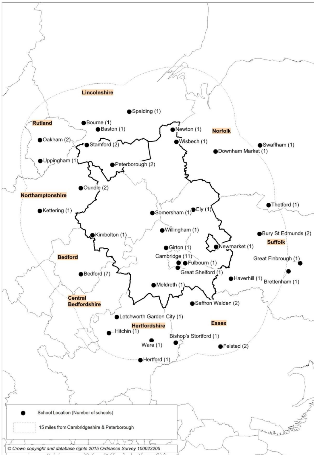
Figure 1: Independent Schools in and around Cambridgeshire and Peterborough